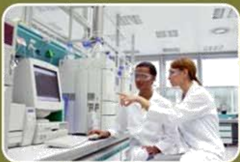
Bio Analytical Research