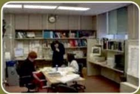
Drug Information Centre