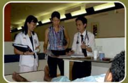
Ward Round Participation